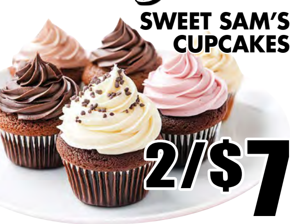
SWEET SAM'S CUPCAKES