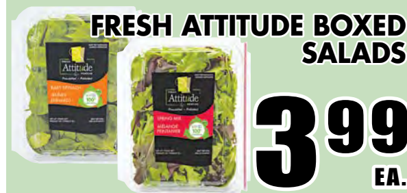
FRESH ATTITUDE BOXED SALADS