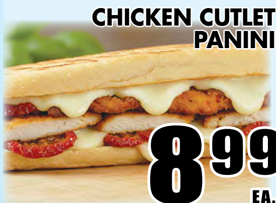
CHICKEN CUTLET PANINI