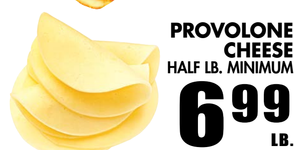
PROVOLONE CHEESE HALF LB. MINIMUM