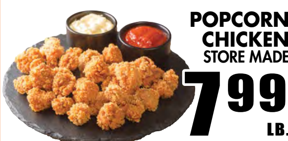
POPCORN CHICKEN STORE MADE