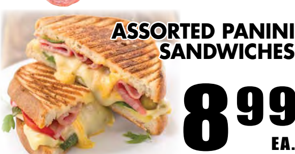
ASSORTED PANINI SANDWICHES