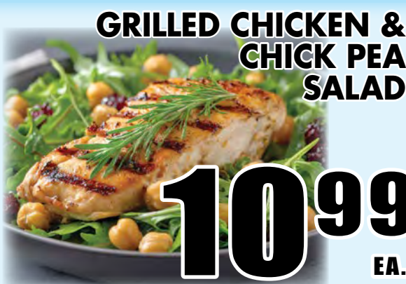
GRILLED CHICKEN & CHICK PEA SALAD