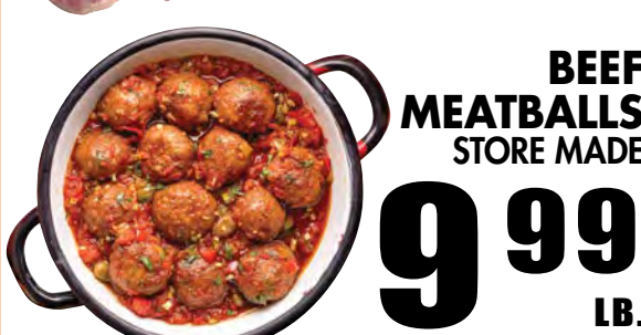
BEEF MEATBALLS STORE MADE