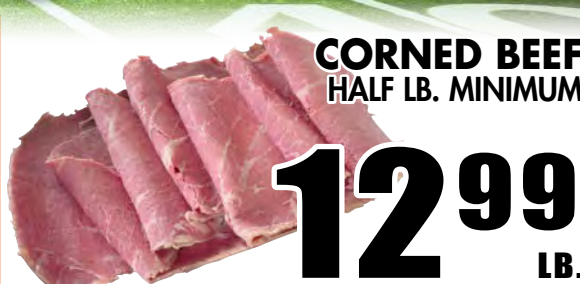
CORNE BEEF HALF LB. MINIMUM