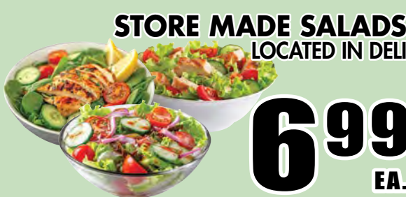
STORE MADE SALADS LOCATED IN DELI