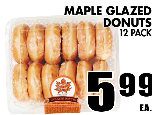
MAPLE GLAZED DONUTS 12 PACK