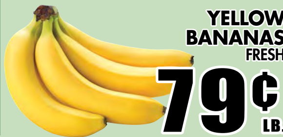
YELLOW BANANAS FRESH