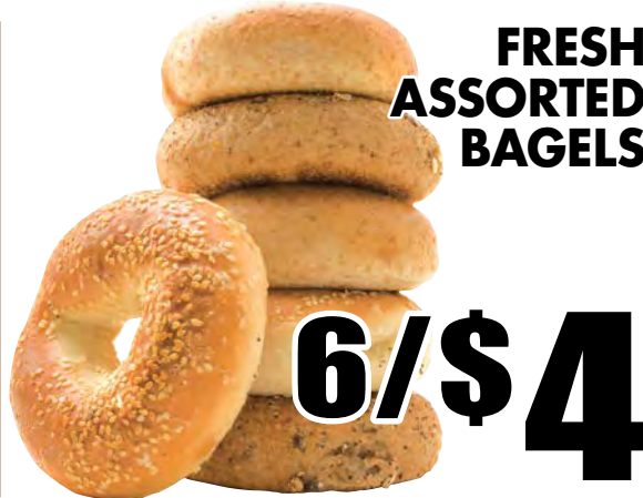
FRESH ASSORTED BAGELS