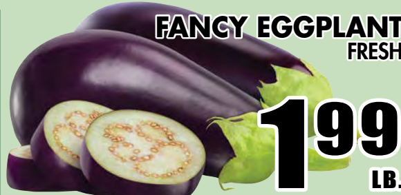
FANCY EGGPLANT FRESH