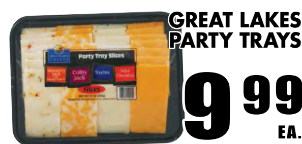
GREAT LAKES PARTY TRAYS