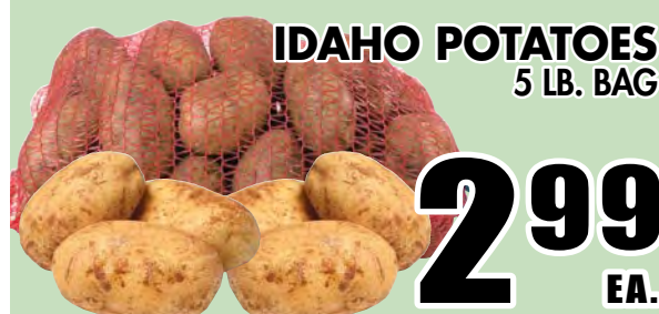
IDAHO POTATOES 5 LB. BAG