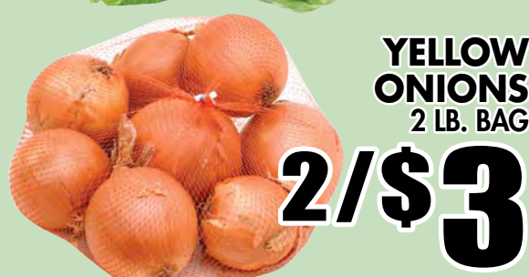
YELLOW ONIONS 2 LB. BAG