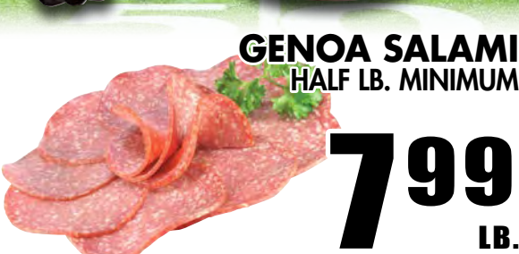
GENOA SALAMI HALF LB. MINIMUM