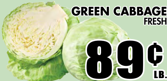
GREEN CABBAGE FRESH