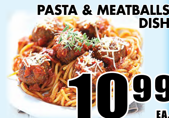
PASTA & MEATBALLS DISH