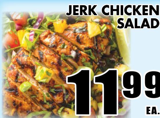
JERK CHICKEN SALAD