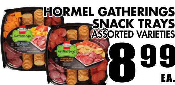
HORMEL GATHERINGS SNACK TRAYS ASSORTED VARIETIES