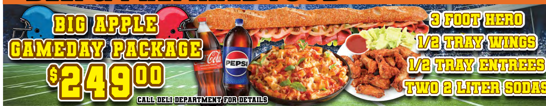
BIG APPLE GAMEDAY PACKAGE