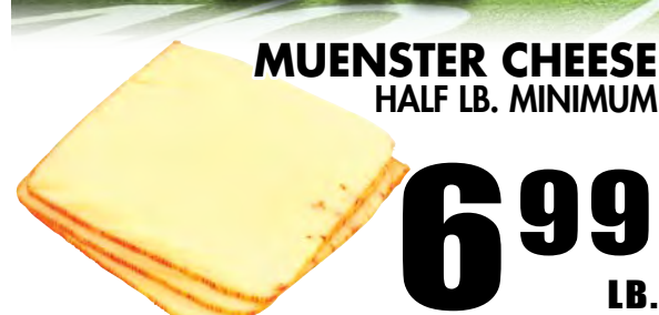
MUENSTER CHEESE HALF LB. MINIMUM